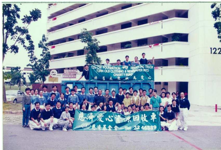
Tzu Chi Singapore's first recycling point in Jurong East in 1999.

Last but not least, we sincerely welcome any collaboration with interested media platforms to promote an eco-sustainable lifestyle.