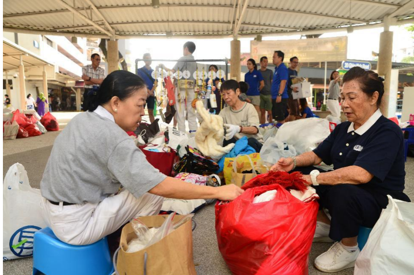
Public engagement of Monthly Recycling Activity before COVID-19.